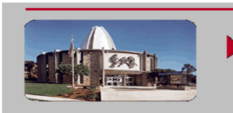
Pro Football Hall of Fame