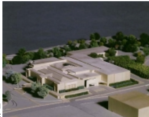
Cleveland Museum of Art