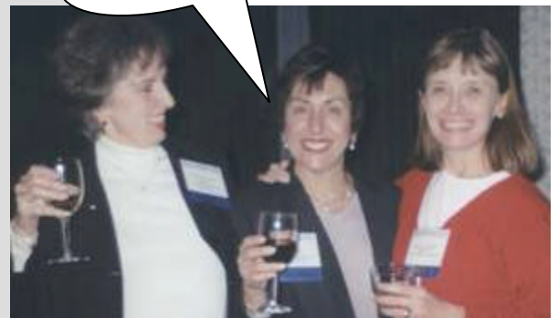
Lots of smiles at the President's Reception!