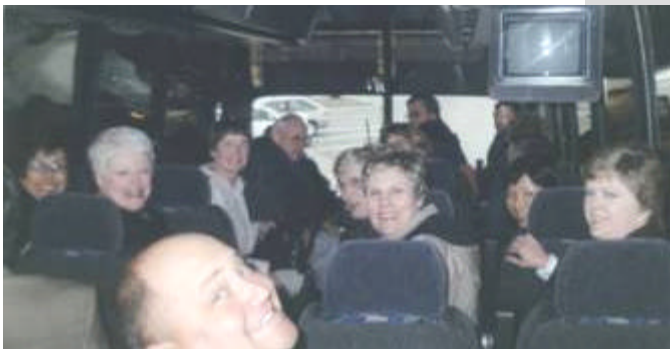
Get on the bus to Edward Jones!