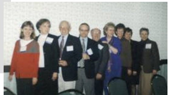
Lots of smiles at the President's Reception!