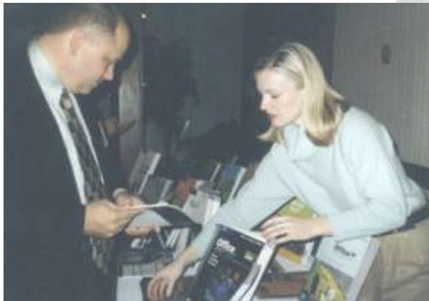
The exhibitors were very helpful!